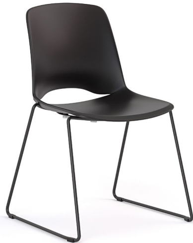
Klever Glide - Standard