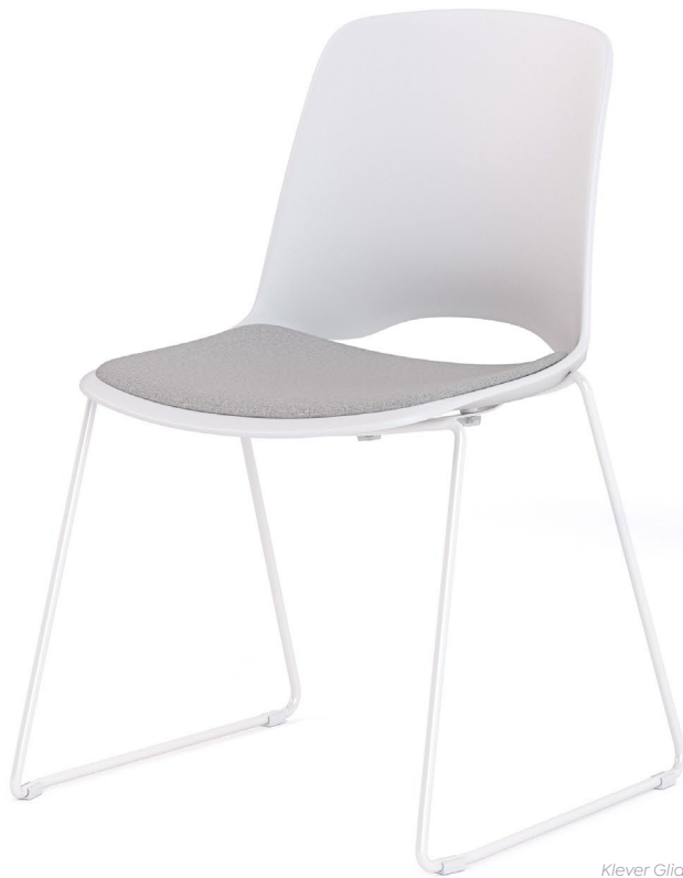
Klever Glide - Upholstered Seat Pad