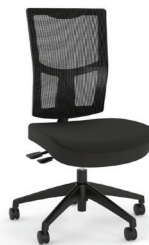
Urban Mesh Nylon Base