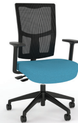
Urban Mesh Optional Arms