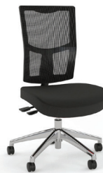
Urban Mesh Alloy Base