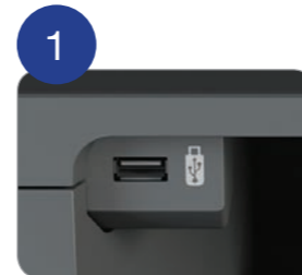
USB direct print*