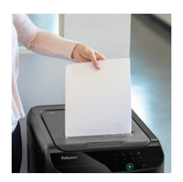
Manual for quick shredding